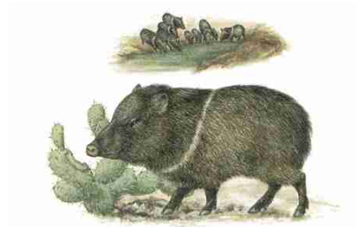
Pecari tajacu – inset shows group at waterhole Credit: painting by Elizabeth McClelland from Kays and Wilson's Mammals of North America, © Princeton University Press (2002)

There are only three species of Peccaries in the world, all in South America. Only Collared Peccaries also live in North America. Their range includes a great variety of habitats, and they eat all kind of vegetation, including cactus. They live in highly social and communicative groups. Grooming is an important social behavior, and they have at least 15 different types of calls signaling alarm, submission, and aggression. Territorial groups of 15–50 animals stay together, and cooperate to defend the herd, but they form subgroups that disperse to feed. An alpha male is the dominant animal in the herd. Peccaries often have twins.